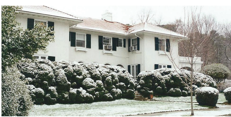
The first Children Incorporated office was located in Mrs. Wood's own home