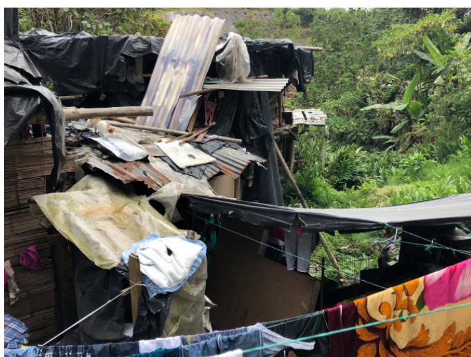
Before moving, the family lived in this dangerous shack that was on the verge of being destroyed by flooding due to heavy rain.

Since then, our volunteer coordinator helped the family move into a house provided by the government and, with the support of Children Incorporated, are able to move in with the supplies they need.