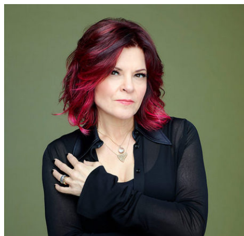
We are very grateful for the support of long-time sponsor Rosanne Cash, who has made a huge impact on American culture during her career.

CHILDREN INCORPORATED / TAX ID# 54-0761510 / 800-538-5381 / CHILDRENINCORPORATED.ORG