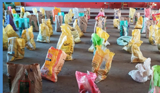
Bags of food contain everything a family will need to have a healthy diet.

Thanks to you, families all over the world are being provided for in this critical time of need. We appreciate all that you do for children living in poverty.