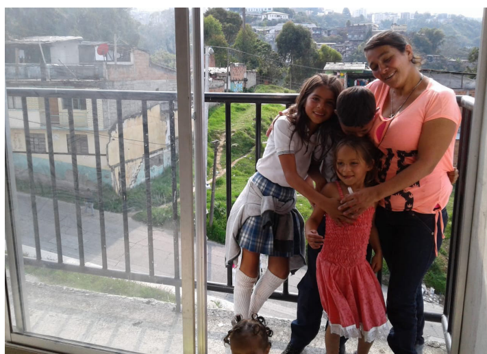
Thanks to the work of our volunteer coordinator and our Hope In Action Fund, they have been able to move out of the slums and into a safe home.