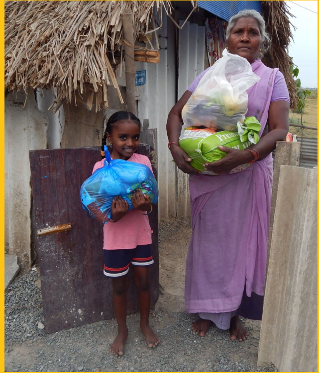
Our COVID-19 Response Fund ensured that families in India had food over the course of the past seven months.

The parents of the children [in the Children Incorporated Program] were happy to receive the given items to support their daily bread in the middle of this time. We have distributed items such as rice, oil, onions, and soap to the families, among other food items, and the beneficiaries convey their heartfelt thanks to the organization for the support.”