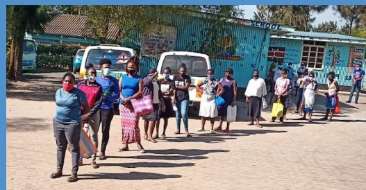
Parents line up outside of the Dandora Center to receive food to take home to their children.