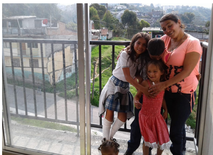
Thanks to the work of our volunteer coordinator and our Hope In Action Fund, they have been able to move out of the slums and into a safe home.