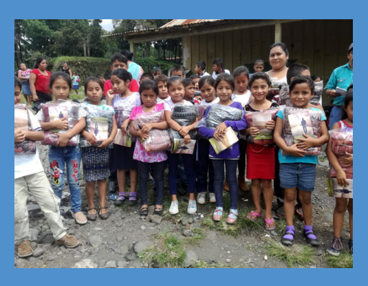
Thanks to our donors, children and families were provide with emergency supplies after a volcano eruption.

Thank you so much for donating to this special fund to assist children and families in rebuilding their lives.